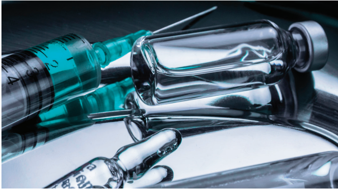
Vaccine & Pharmaceuticals