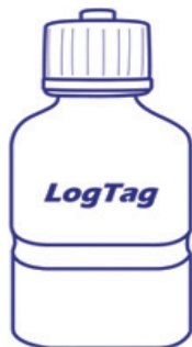
Glycol Buffer Not Included